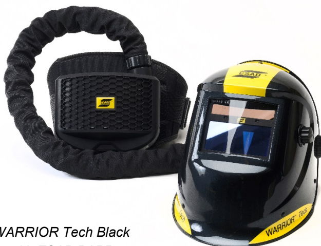
WARRIOR Tech Black with ESAB PAPR